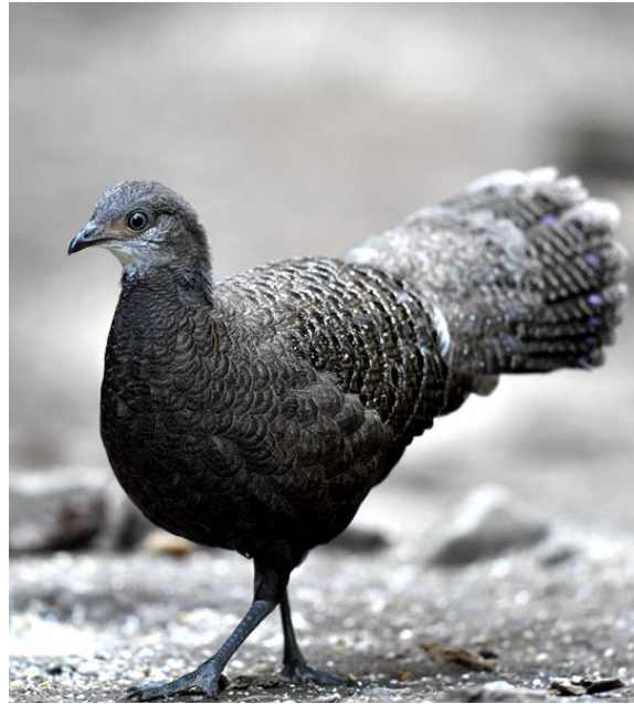
Grey Peacock Pheasant