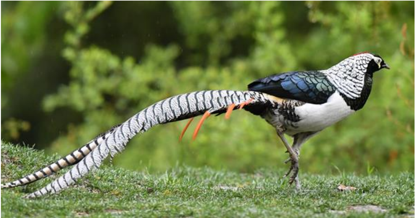
Lady Amherst's Pheasant

we will complete a 4.5-hour journey to the Gaoligong Mountains.