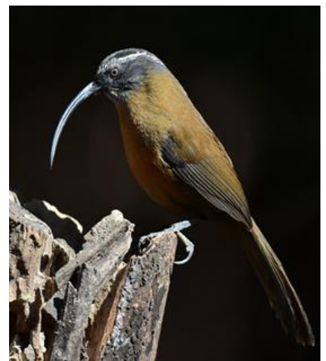
Slender-billed Scimitar Babbler

We will spend two days here searching for birds in different habitats. Some species tend to feed on the ground such as Silver Pheasant, Mrs. Hume's Pheasant, Hill Partridge, Mountain Bamboo Partridge, Rufous-throated Partridge, Slender-billed Scimitar Babbler, Red-tailed Laughingthrush, Chestnut-crowned